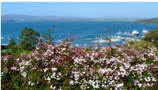
Beauty Point lived up to its name!